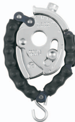
RIGHT CAM 50% OPEN

Keep your spring tension loose because even one or two turns will make a very big difference.