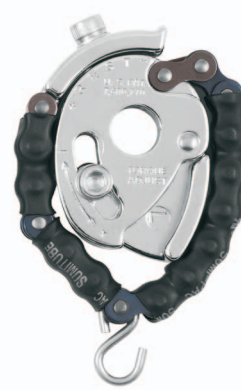
LEFT CAM 50% OPEN